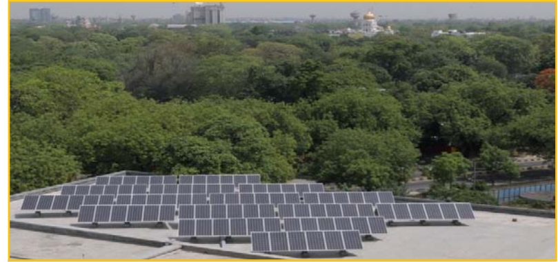
Solar Power Plant Location: Parliament House, New Delhi Capacity: 80 KWp Date of Commissioning: March 2011