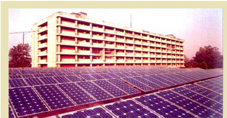
Rooftop Solar Photovoltaic Power Plant Location: Punjab Mini- Secretariat Capacity: 50 KWp Date of Commissioning: March 1999