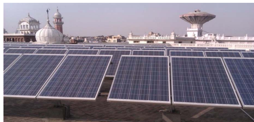
Rooftop Solar Photovoltaic Power Plant Location: Golden Temple, Sri Amritsar Sahib Capacity: 25 KWp Date of Commissioning: August 2011