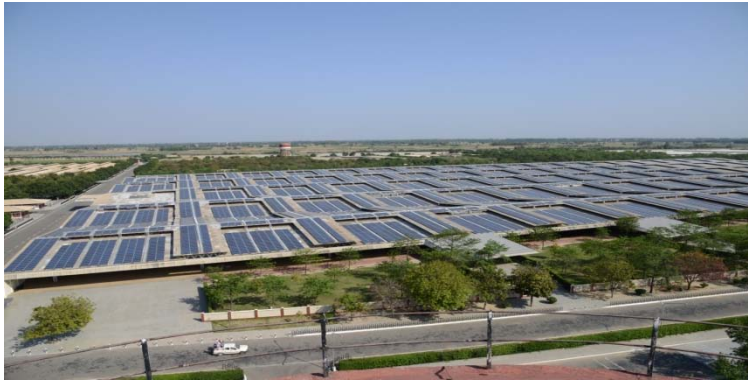
Rooftop Solar PV Power Plant Location: Dera Beas, Amritsar Capacity 7.52 MW Date of Commissioning: April 2014 (Worlds Largest Single Rooftop Project)